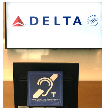
Detroit Metro Airport, Detroit, MI