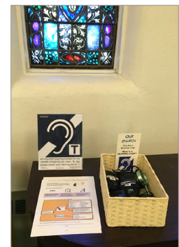
First Congregational Church, Boulder, CO